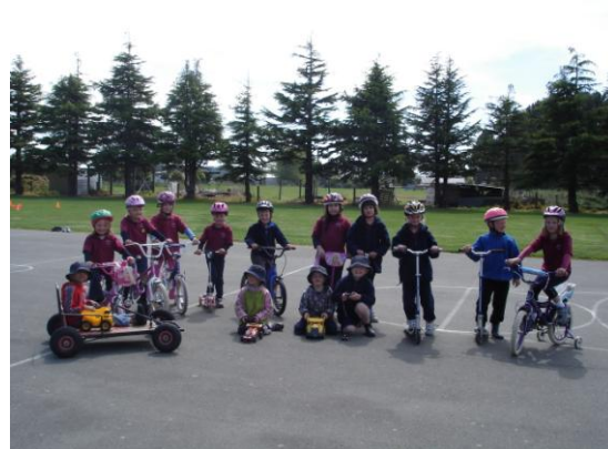
Wonderful Wheels Afternoon.

Friday 22 nd – Cooking WAVE. P.A.L.'s Day in Tu.